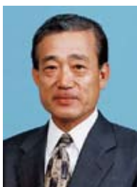
Keynote Speaker Takeo Fukui President and Chief Executive Officer Honda Motor Co., Ltd.

A long-established tradition at the SAE World Congress, the Annual Banquet is the largest and most prestigious gathering of automotive industry leaders from around the world—allowing guests an opportunity to network with the most influential people in the business during the Pre-Banquet Reception and Afterglow. Join us at the industry's premier gala as we celebrate our accomplishments and honor top OEM and supplier executives.