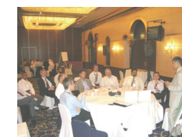
TABLE 4 – Technology in Focus A look at technology advances and developments.

TABLE 3 – Feedstocks What is the long-term situation in the Middle East?