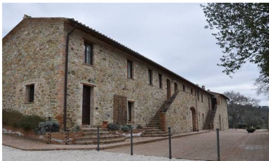
Residenza Montebuono at Lake Trasimeno

An illustrated walk through 20 years of activity in Climate Alliance, together with pathfinders, "midwives" and supporters. Let's celebrate!