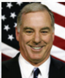
Governor Howard Dean Chairman, Democratic National Committee, 2005–2009