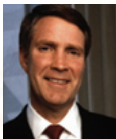
Senator William H. Frist, MD 18th Majority Leader, U.S. Senate, 2003–2007