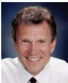
Senator Tom Daschle Former Senate Majority and Minority Leader