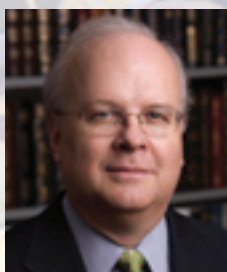
Karl Rove Former Deputy Chief of Staff and Senior Advisor to President George W. Bush