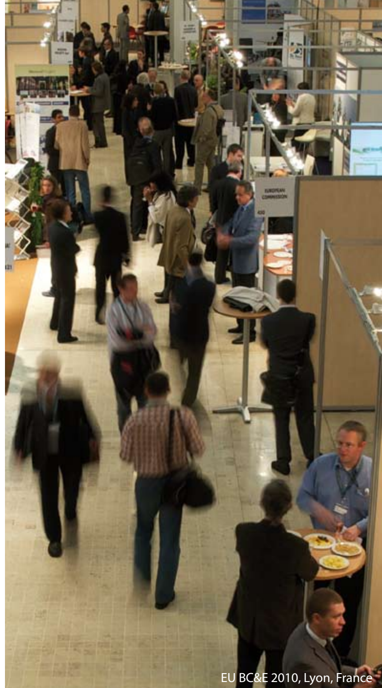
EU BC&E 2010, Lyon, France