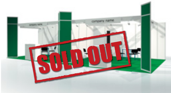
25 sq. metres, 19,490 EUR + VAT