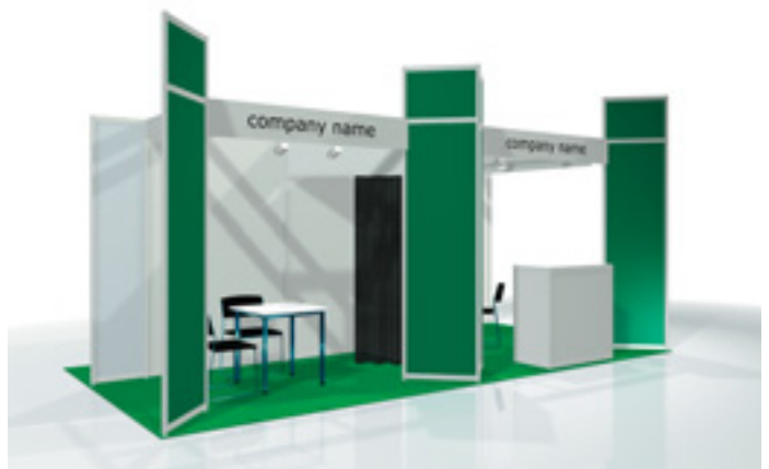
6 sq. metres, 3,390 EUR + VAT

The packages consist of fully equipped Presentation Booths, PR Services, Event marketing and a certain amount of free tickets for your partners and customers. Please note that Platinum Packages are limited. World Bank, IETA and Koelnmesse reserve the right to select the Platinum Package holders amongst respective applicants.