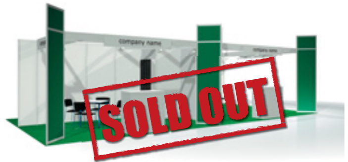
15 sq. metres, 11,490 EUR + VAT