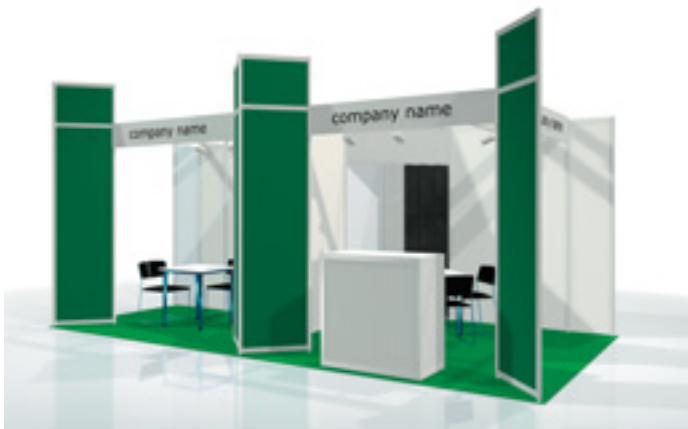
9 sq. metres, 4,490 EUR + VAT