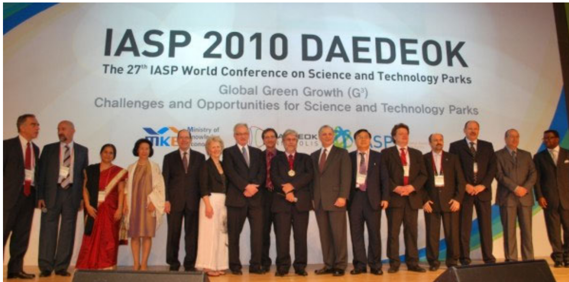
Members of IASP International Board of Directors